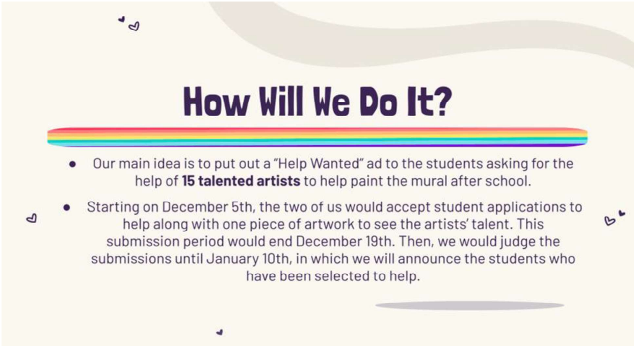
Help Wanted Ad